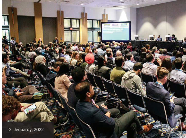
GI Jeopardy, 2022

Celebrate diversity in ACG by sponsoring the reception which will be held on Sunday, October 22. ACG's Women in GI Committee and the Diversity, Equity & Inclusion Committee are transforming their annual reception into a forum for networking and meaningful conversation. Hors d'oeuvres and drinks are offered at the happy hour space. Your company will be recognized in event promotion and on signage at the event. A limited number of company personnel will be invited to attend.