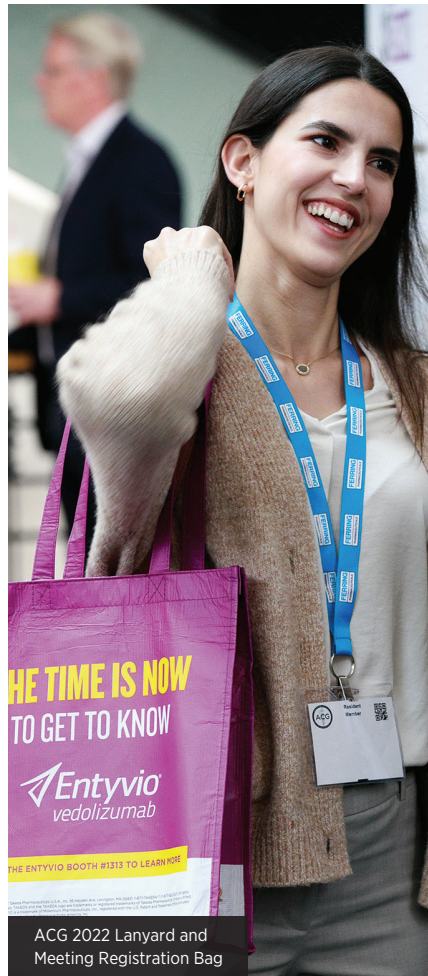
ACG 2022 Lanyard and Meeting Registration Bag