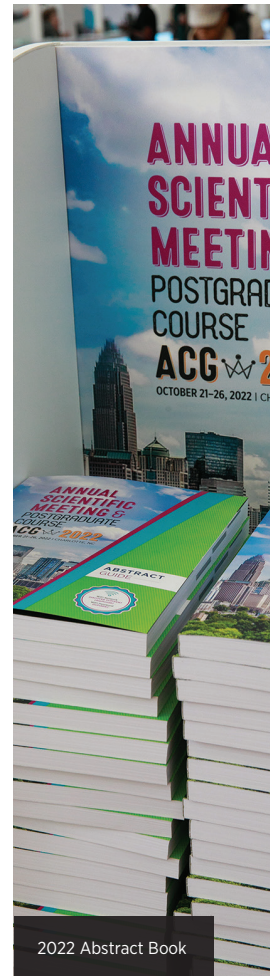
2022 Abstract Book